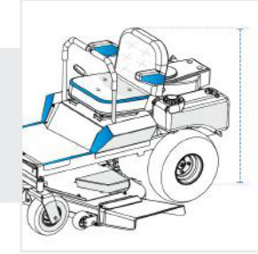
1. Height: Height of the Zero Turn Mower