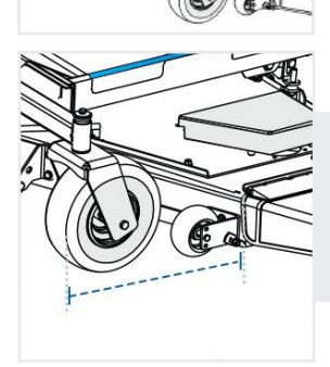
6. Depth #2: Depth (Side #2)