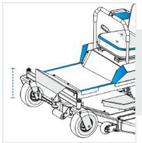
4. Front Height: Front Height of the Zero Turn Mower