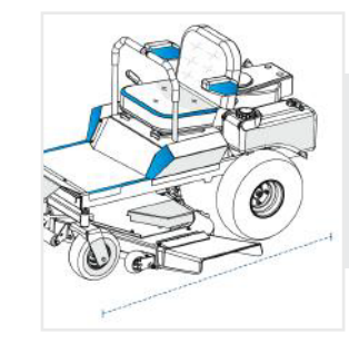
2. Depth: Depth of the Zero Turn Mower