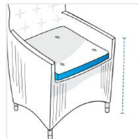
2. Width: Width of the Chair

✓ We add 2.5 to 5 cm leeway on the given width/depth for easy pull-in and pull-out.