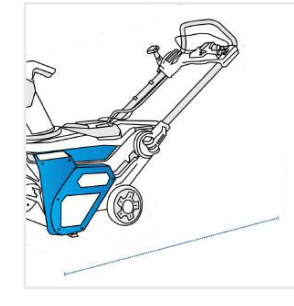
2. Depth: Depth of the Custom Cordless Snowblower