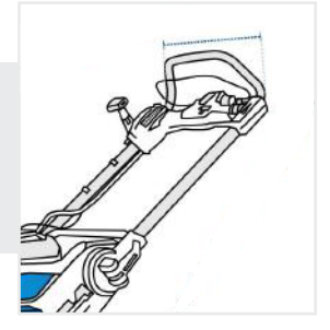
9. Handle Width: Handle Width of the Custom Cordless Snowblower

8. Depth from chute to handle: Depth from chute to handle of the Custom Cordless Snowblower