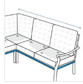
2. Length of Back - Right: Length of Back - Right of the Sofa