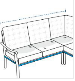
1. Length of Back - Left: Length of Back - Left of the Sofa