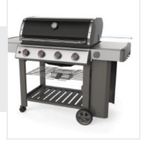
5. Right Shelf Width: Right Shelf Width of the Grill Cover for Weber Genesis II E-410 Gas Grill