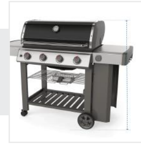
1. Height: Height of the Grill Cover for Weber Genesis II E-410 Gas Grill