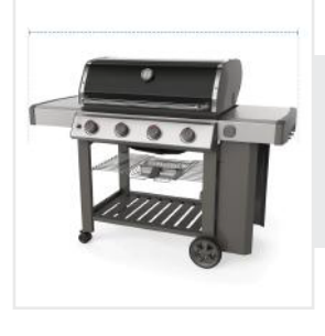
2. Width: Width of the Grill Cover for Weber Genesis II E-410 Gas Grill

3. Depth: Depth of the Grill Cover for Weber Genesis II E-410 Gas Grill