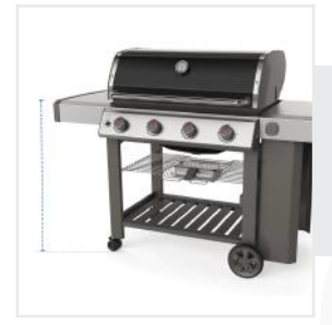
6. Shelf to Ground: Shelf to Ground of the Grill Cover for Weber Genesis II E-410 Gas Grill

We encourage you to upload the image of the article you need the cover for - this helps our team ensure covers are designed keeping your requirements in mind.