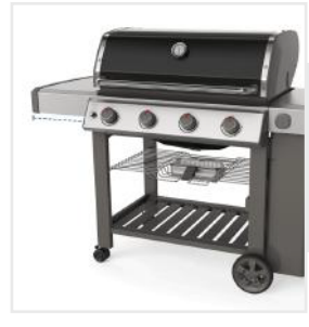
4. Left Shelf Width: Left Shelf Width of the Grill Cover for Weber Genesis II E-410 Gas Grill