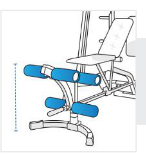
4. Front Height: Front Height of the Multi-Gym Equipment