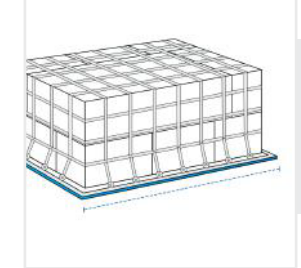
2. Width: Width of the Pallet