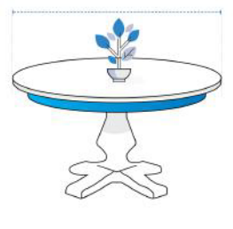
2. Diameter: Diameter of the Round Accent