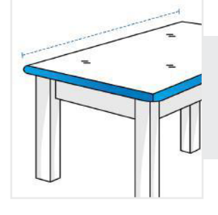
2. Width: Width of the Table

✓ "We add upto 5 cm leeway on the given width/depth for easy pull-in and pull-out."