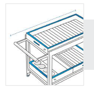
2. Width: Width of the Trolley/Tray Cart

We encourage you to upload the image of the article you need the cover for - this helps our team ensure covers are designed keeping your requirements in mind.