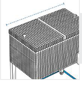
2. Width: Width of the Trolley/Tray Cart

We encourage you to upload the image of the article you need the cover for - this helps our team ensure covers are designed keeping your requirements in mind.